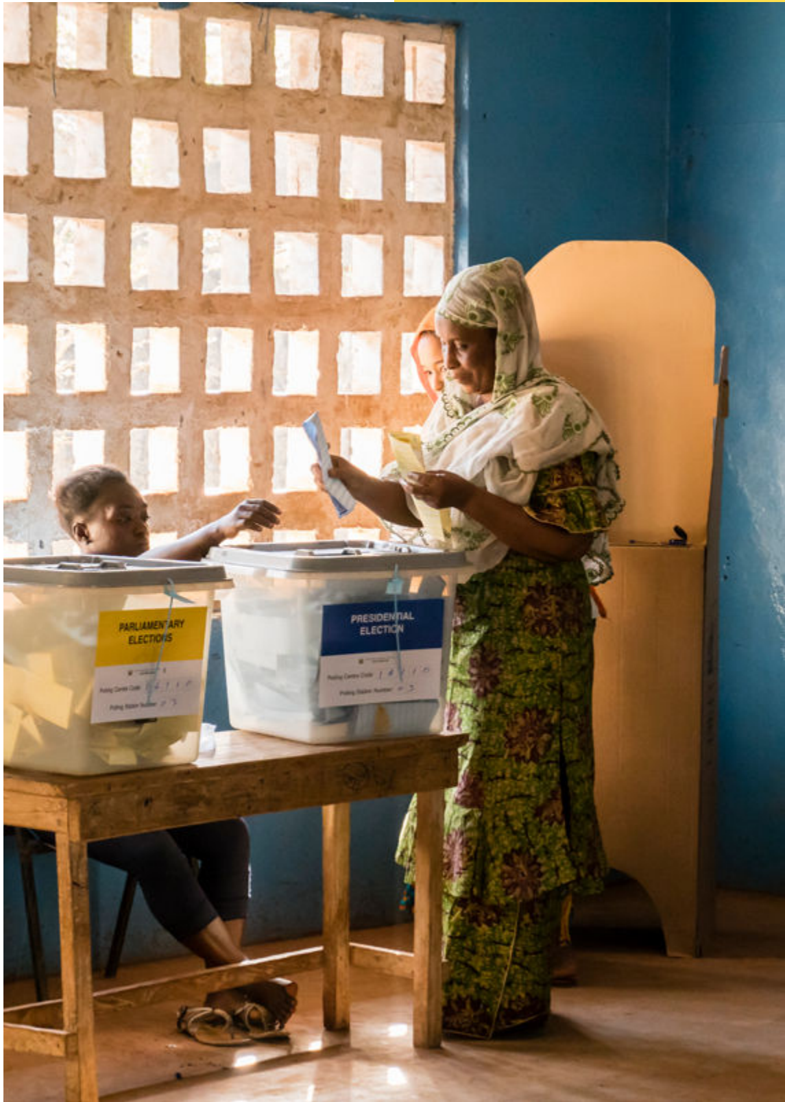
Sierra Leone Elections march 2018.