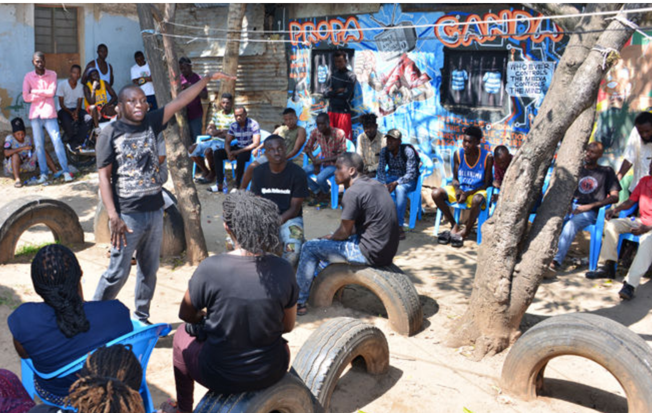
Youth from Kisumu Ndogo Maskani in Nyali constituency participate in a Gumzo Mtaani.