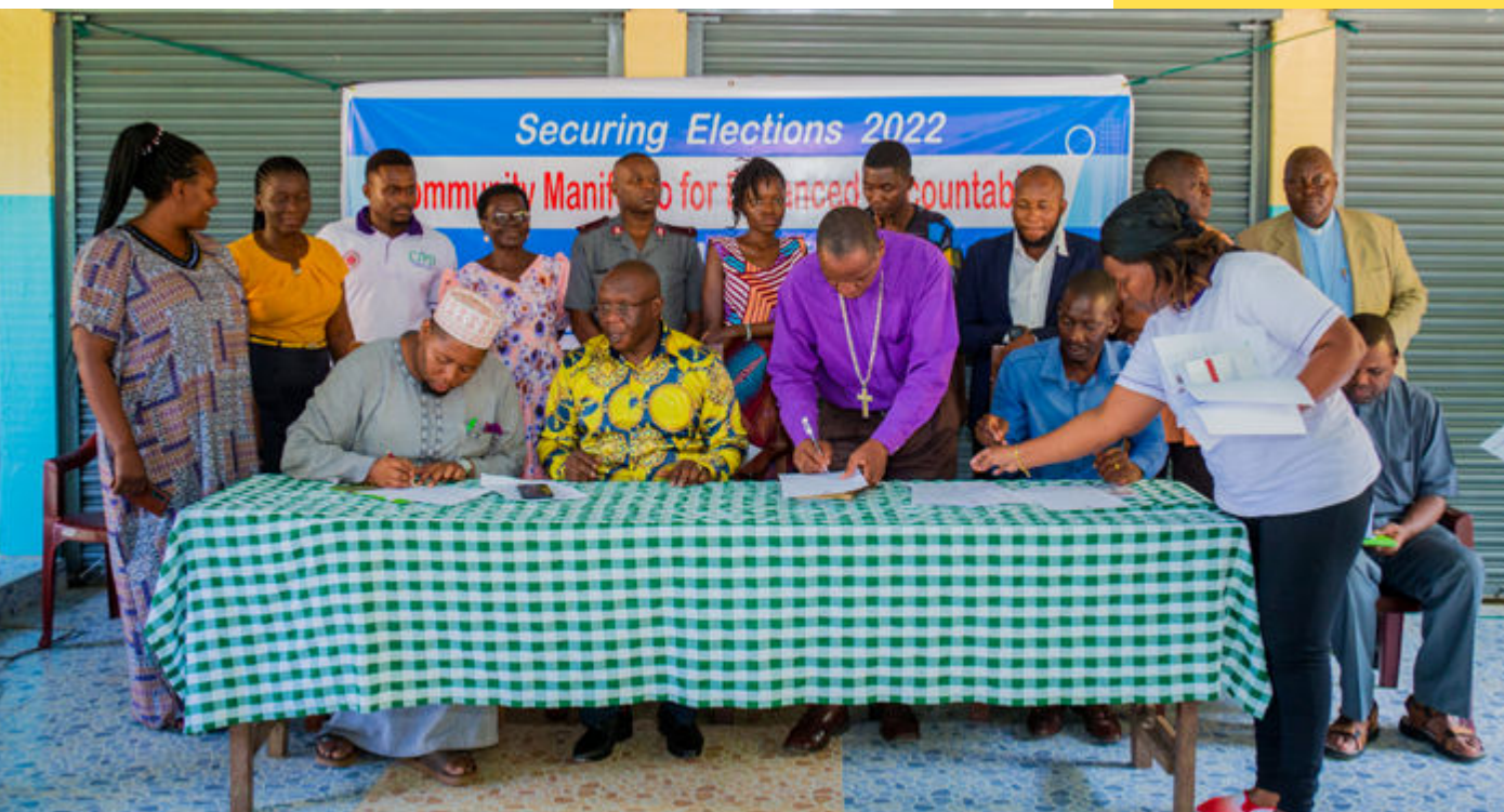
Leaders sign a commitment to peaceful elections in Kilifi, Kenya.