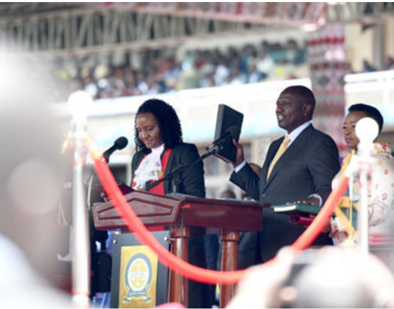
Deputy President David Mabuza attends the inauguration of President-elect, H.E. William Samoei in Nairobi, Kenya.