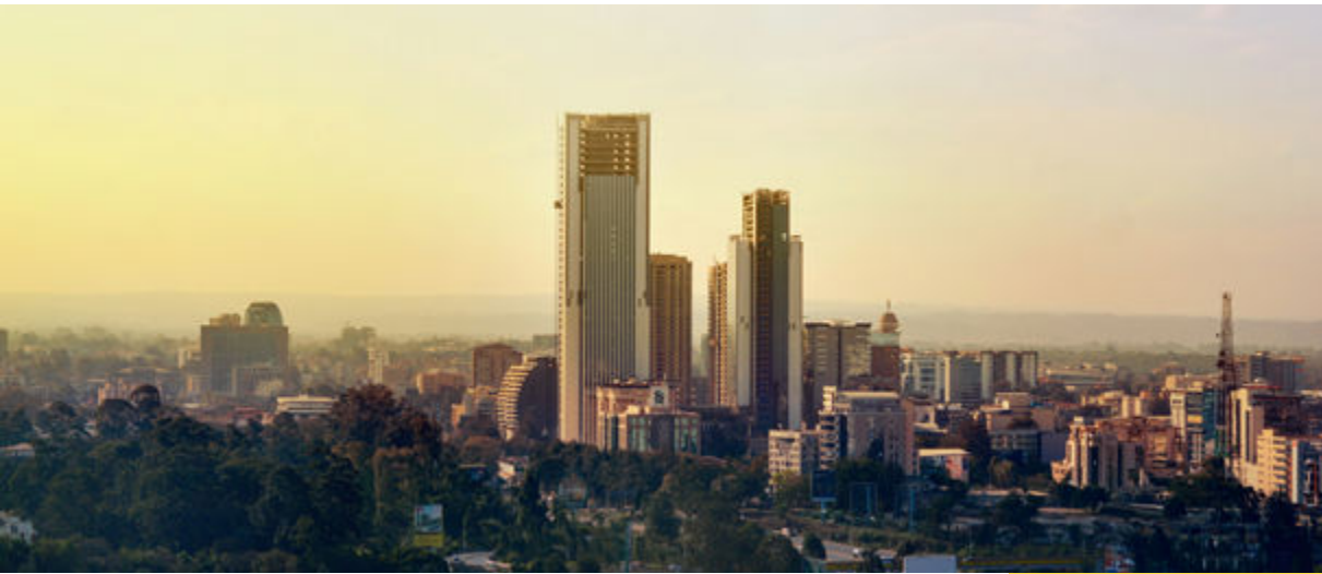
Nairobi, Kenya.

even as implementation challenges remain (Sowa, 2025). Over time, as enforcement practices mature and institutional capacity deepens, Sierra Leone's model is positioned to generate substantial behavioural change, consistent with patterns observed in other contexts with strong legal mandates (LeBas, 2011).