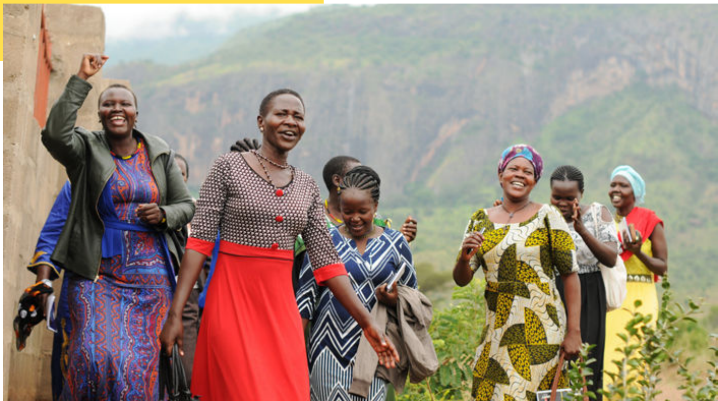
Members of women’s forums are enjoying their newfound voice and role in cross border peace building.

Sierra Leone stands out for its recent legislative advances, particularly the Gender Equality and Women’s Empowerment Act, which mandates a 30% quota for women in elective and appointive positions. These reforms have contributed to relatively high levels of women’s representation, with over 30% female parliamentarians in the most recent election cycle (Sowa, 2025). Despite this progress, women continue to face barriers, including intimidation, online harassment, and male-dominated party structures, which require sustained institutional and cultural interventions.