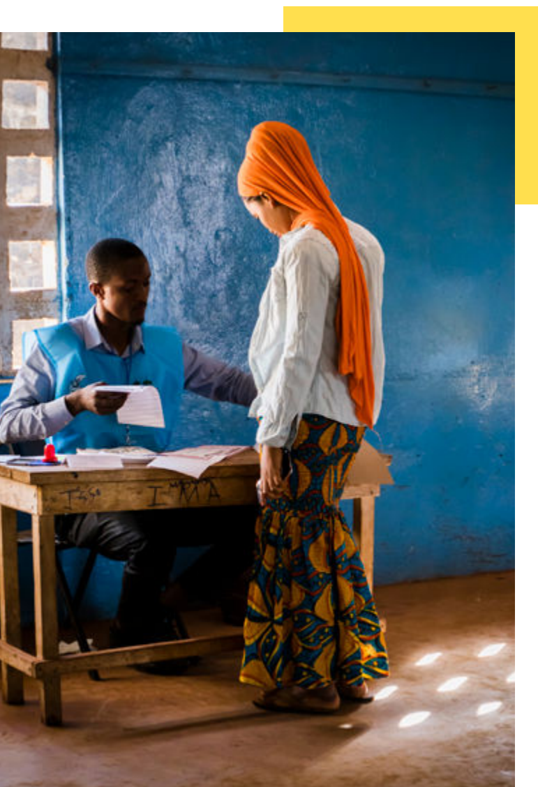
Sierra Leone Elections march 2018.

considering that this initiative will increasingly have to attract more members, the establishment of the AAPPRA would have follow a phased, adaptive, and capacity-aware trajectory. This approach ensures that the association grows organically, consolidates legitimacy gradually, and avoids front-loading institutional demands that emerging regulators may struggle to meet. Lessons from regional governance networks (ECONEC, ECF-SADC, AOMA, and AAACA) show that successful institutions rarely emerge fully formed; rather, they evolve through iterative phases marked by learning, experimentation, and incremental institutionalisation.