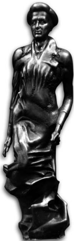
Rolf Biebl, Rosa Luxemburg, Statue